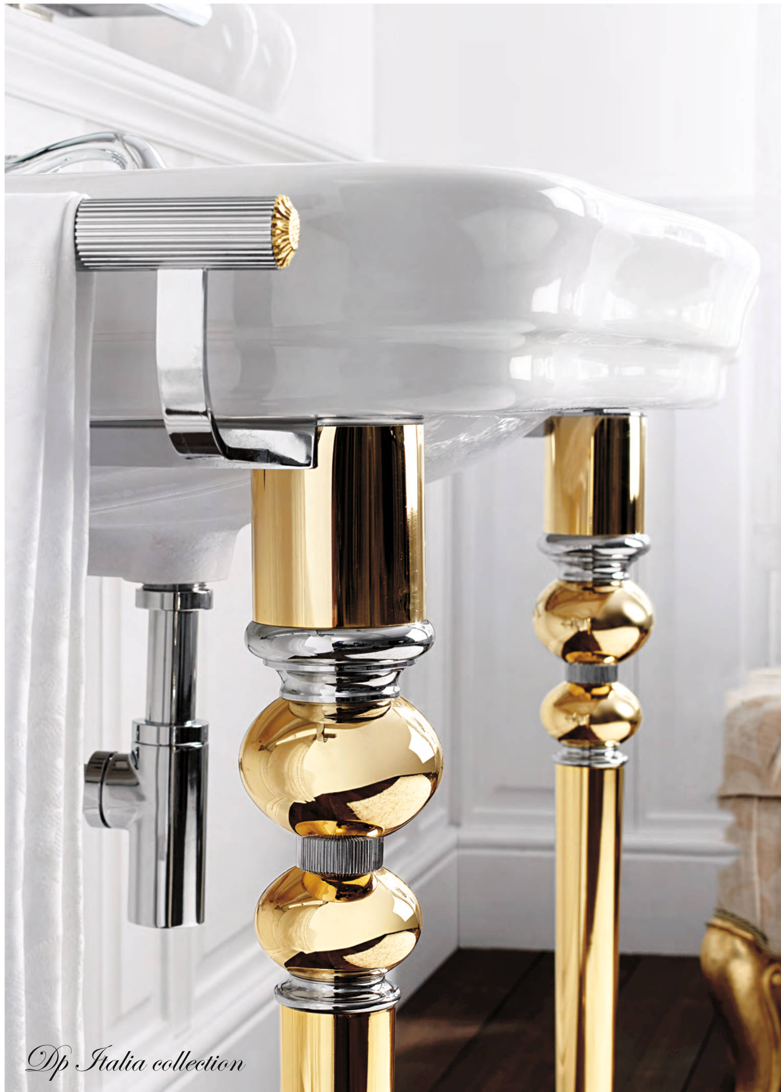
Dp Italia collection