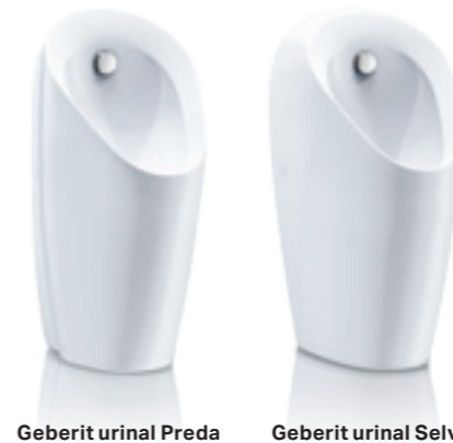
Geberit urinal Preda Geberit urinal Selva